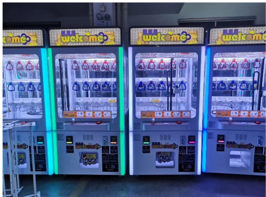
Shoe Store gift prizes key master vending machine The Key Master Challenge win prizes keymaster arcade games