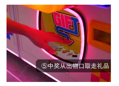
5. Winning prizes take gifts