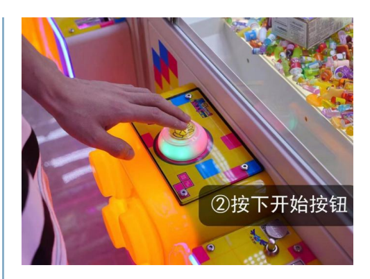
2.Press the start button