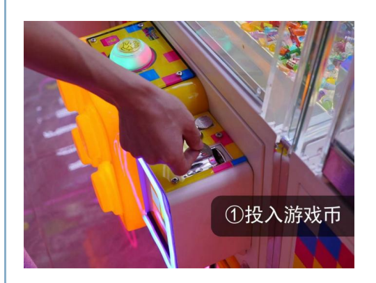
1.Put in game coins