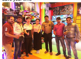
10 years experience in game machine

Each one part and game are strictly inspected before being delivered