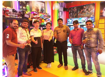
10 years experience in game machine

Each one part and game are strictly inspected before being delivered