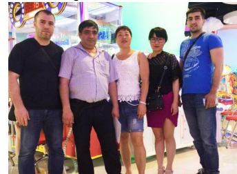
Stay with you

CE certificate help you import without doubt and problem